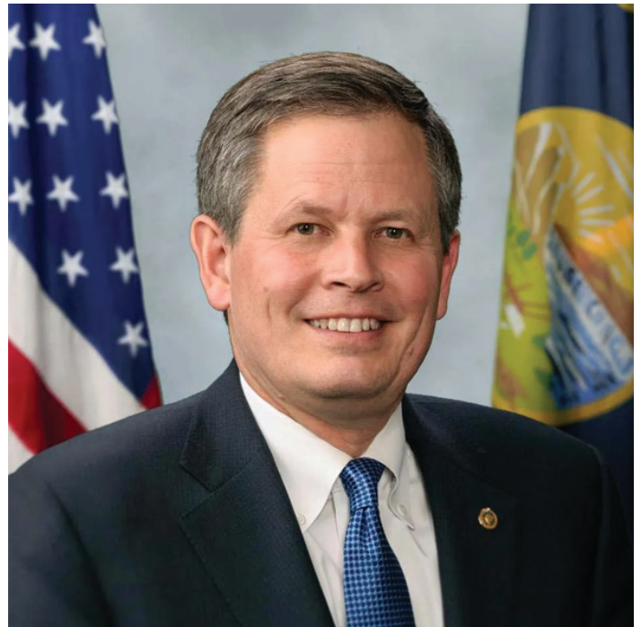
Senator Steve Daines

Senator Steve Daines, Governor Greg Gianforte, Ryan Zinke, some in the Media (all Republicans) – trusting that they can mentor Tim Sheehy into their fold.